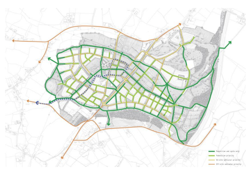
Illustrative work-in-progress for a network of active modes.