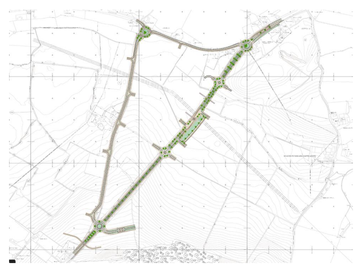
Illustrative work-in-progress on current thinking in respect of the design of the A38.